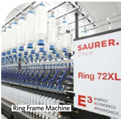
Ring Frame Machine