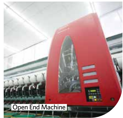
Open End Machine