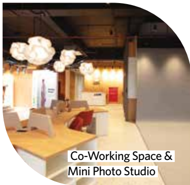
Co-Working Space & Mini Photo Studio